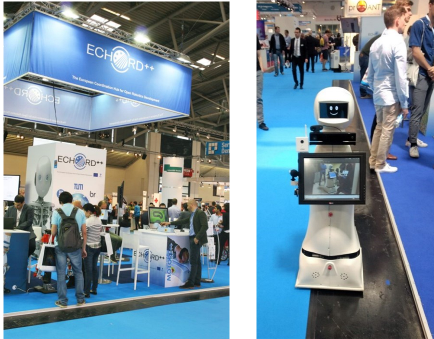
Figure 3: (Left) The ECHORD++ stand in the Automatica fair and (right) the CLARA robot

From Automatica fair we had some contacts that were interested on the design and application scenario or as a technology provider.