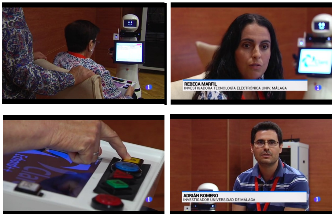
Figure 10: CLARC project in RTVE (September 2018)