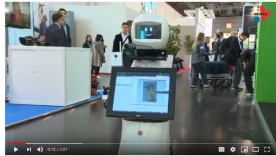
Patientenversorgung der Zukunft? Robotik, AI und Big Data auf der MEDICA 2018