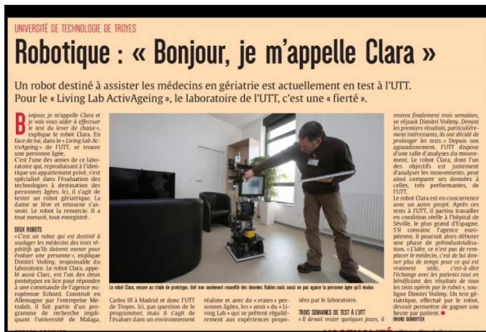
Figure 5: The CLARA robot in the L'Est Éclair newspaper

The first new on a newspaper was on January 2017, in the L'Est Éclair newspaper. Figure 5 shows the new in press.