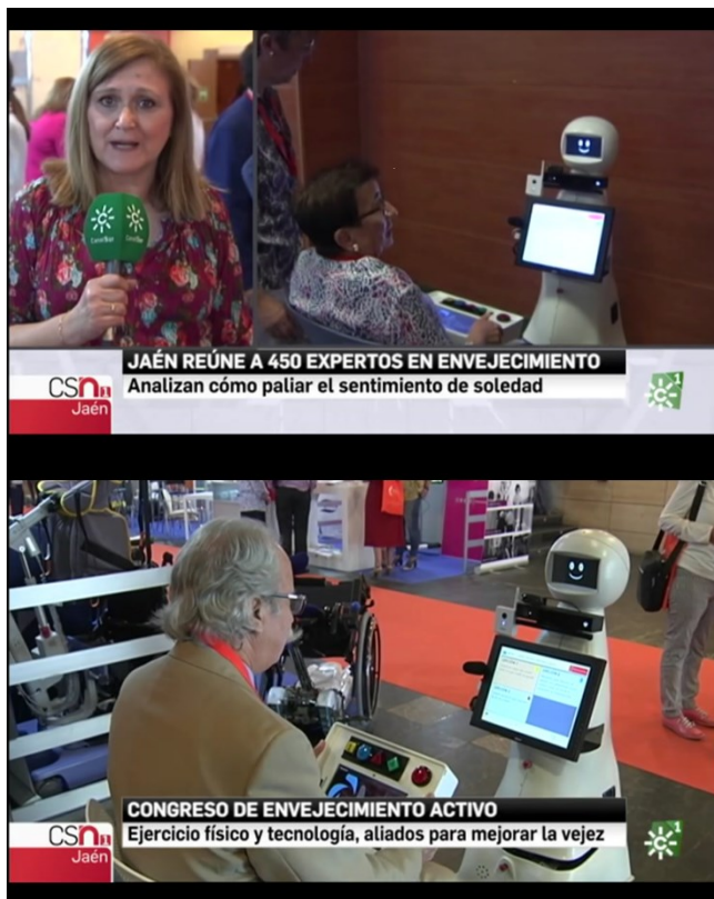
Figure 9: CLARC project in CanalSur (September 2018)