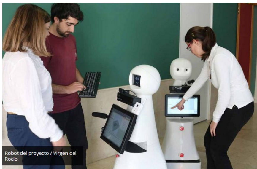
Figure 6: The old and new versions of the CLARA robot in

More recently, a new about the CLARC project was presented in the Sevilla Actualidad digital newspaper (Figure 6).