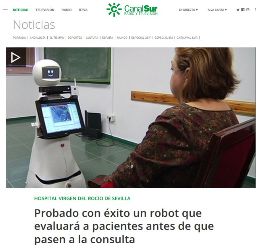
Figure 8: CLARC project in CanalSur (November 2017)

After updating the robot's appearance, a brief new in November 2017 covered the CLARC project in CanalSur, the regional TV on Andalusia (Spain).